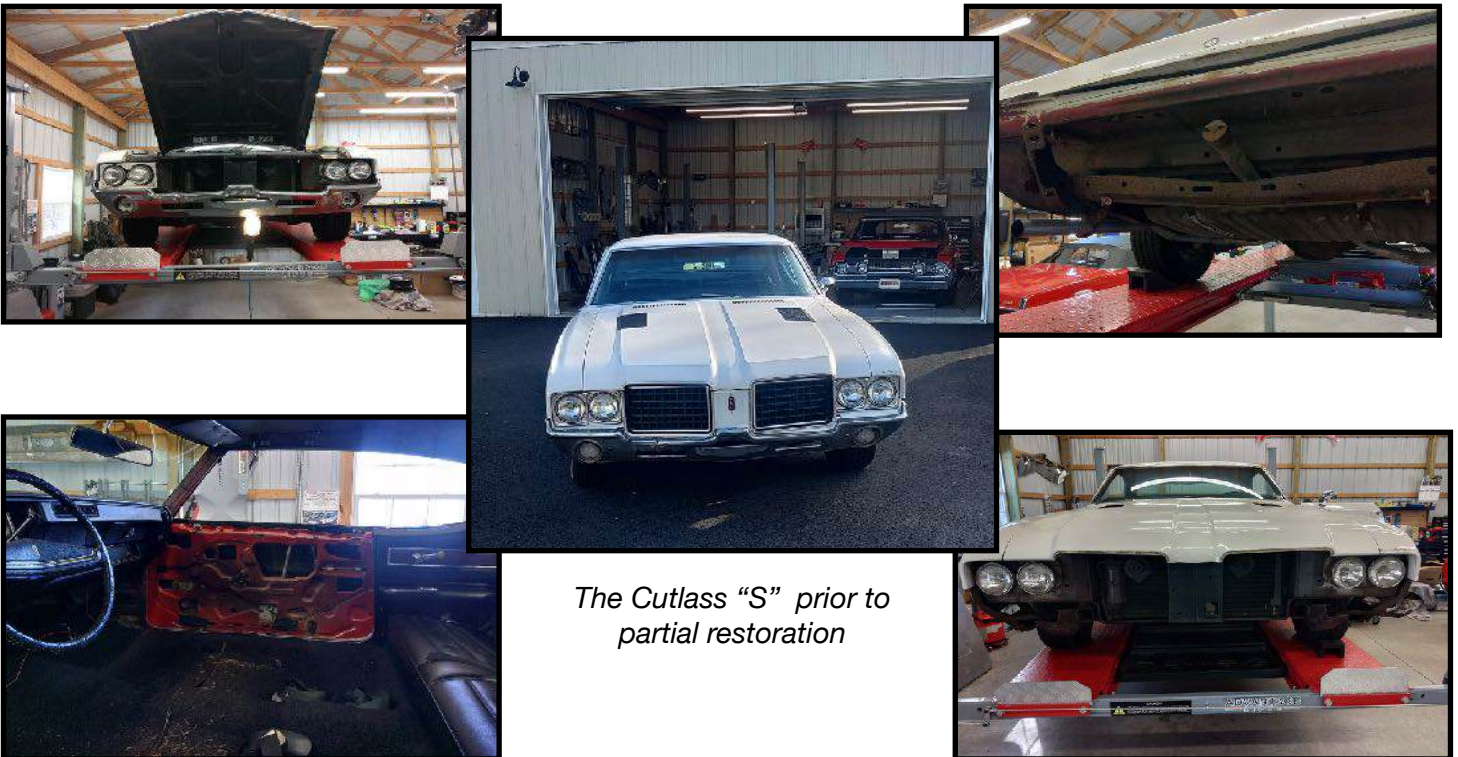
The Cutlass "S" prior to partial restoration

I hope you may find some interest in following an ongoing set of updates on the steps of the restoration of our Cutlass. Please see the photos below.